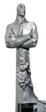
TITAN Polska sp. z o.o. Winner of start-up geotechnical company 2006